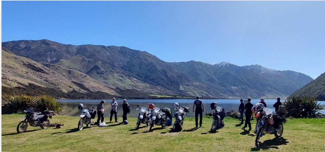
Mountain lake next to shearers quarters